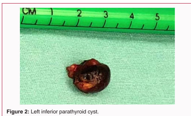
Figure 2: Left inferior parathyroid cyst.